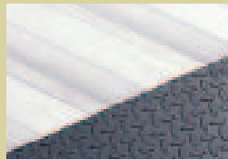
Diamond plate with 1 1/2" steel deck

Handrails Our handrail is one of the most innovative on the market. The continuous handrail is easily cut to size and reattached without welding, and the handrail post design eliminates the need for notching the deck surface on installation.