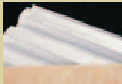
1 1/2" steel deck with plywood, OSB or composite resin board